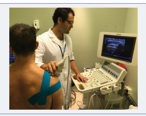
Figure 1: Ultrasound after application of taping.

Significant changes in AHD (Figure 2), pain, and anterior flexion were registered after taping.